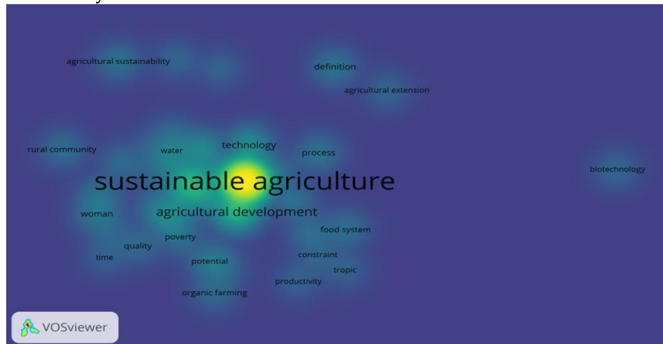
Figure 3. Density Visualization